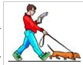
Get out and enjoy town!

ing our youth the opportunity to learn important skills while honing their leadership skills. Over 1000 youth are served annually by the Club