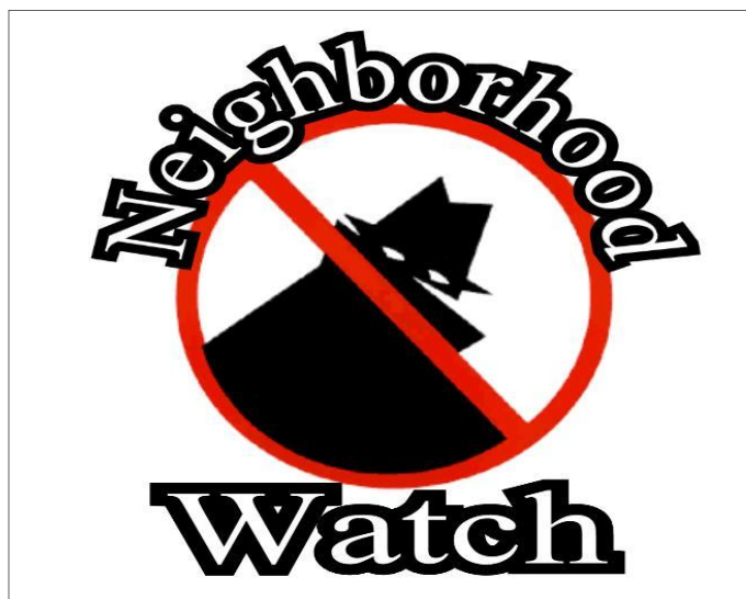
Neighborhood Watch-A Community Effort in Improving Quality of Life

Identify crime or quality of life issues in your area/neighborhood. This is done by talking and networking with neighbors, business leaders and stakeholders